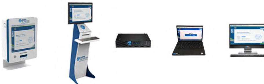
Delivery options: Wall mounted, Stand-alone kiosk, Micro PC, Laptop and All-in-one